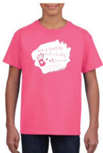
Gildan Ultra Cotton T-Shirt

Pink Shirt Day is February 27, 2019! Show your support for a bully-free school environment with a Northern Lights Public Schools pink shirt!